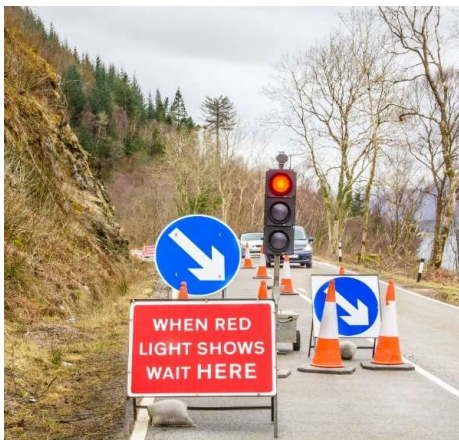
Temp traffic lights